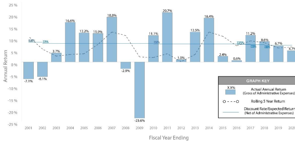
History of Investment Returns (2001 - 2020)

The table below shows annualized investment returns of the PERF for various time periods ending on June 30, 2020 (figures reported are net of investment expenses and gross of administrative expenses). These returns are the annual rates that if compounded over the indicated number of years would equate to the actual performance of the PERF. It should be recognized that in any given year the rate of return is volatile. The portfolio has an expected volatility of 11.4% per year based on the most recent Asset Liability Modeling study. The realized volatility is a measure of the risk of the portfolio expressed as the standard deviation of the fund's total monthly return distribution, expressed as an annual percentage. Due to their volatile nature, when looking at investment returns, it is more instructive to look at returns over longer time horizons.